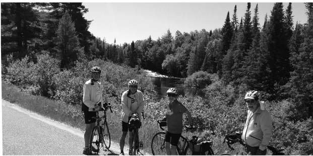
Everton Falls, Red Tavern Road, ADK Cycle Outing.

Jan. 18-20, 2019: ADK Tug Hill Winter Outing. For details, and registration see below; or visit the Club website: https://www.adk.org/play/snow-sports-information/winter-outing/