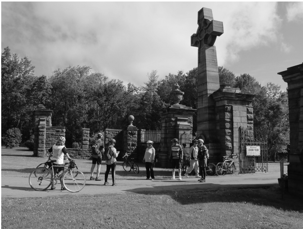
Red Sandstone architecture at Bayview Cemetery, ADK Cycle Outing.