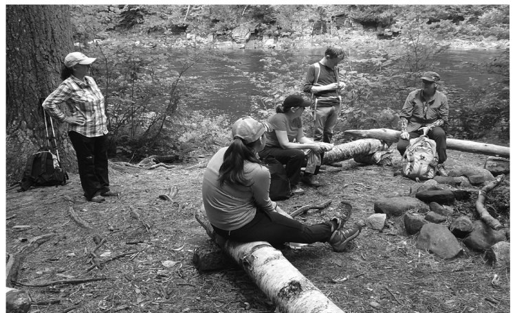
OK Slip Falls : Photo Tom Ortmeyer

The plan also includes significant conservation and management components. In summary, the approval of the Grass River Wild Forest UMP be followed by implementation of the plan, which in turn will provide us with some new and interesting places to explore.