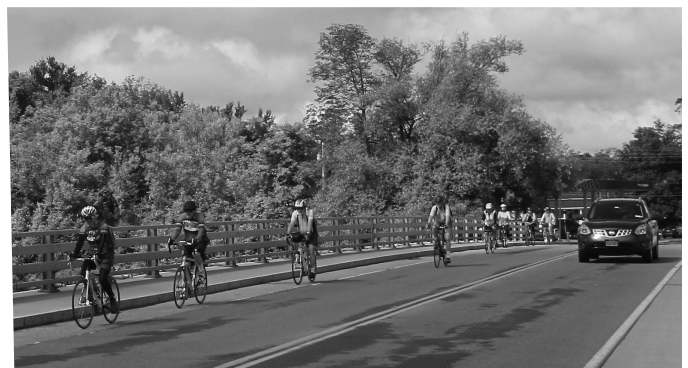
Fall Island Bridge- Potsdam - ADK Cycle Outing.