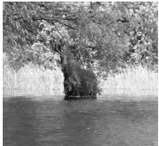
Debar Pond Moose.