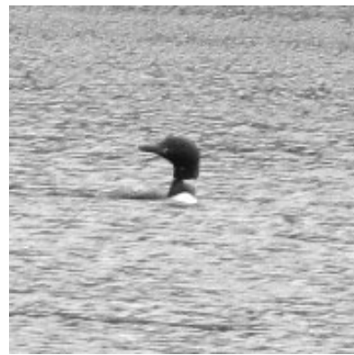
Debar Pond Loon.

September 2018 Mt. Desert Island/Acadia National Park in September. Cancelled due to lack of participants.