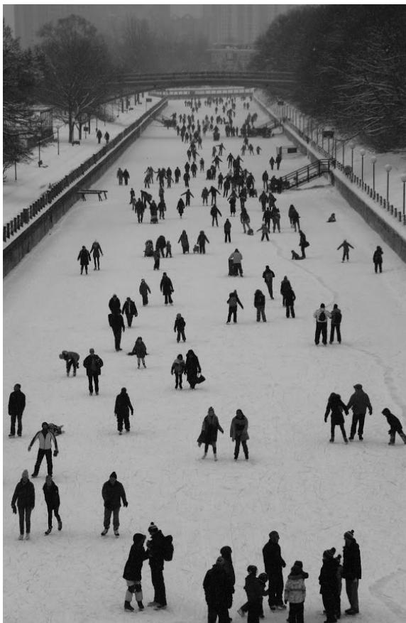
Skating on the Rideau Canal.