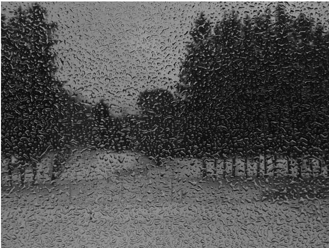
Ice Storm Impression.