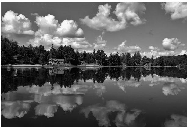
Landscape (untitled).