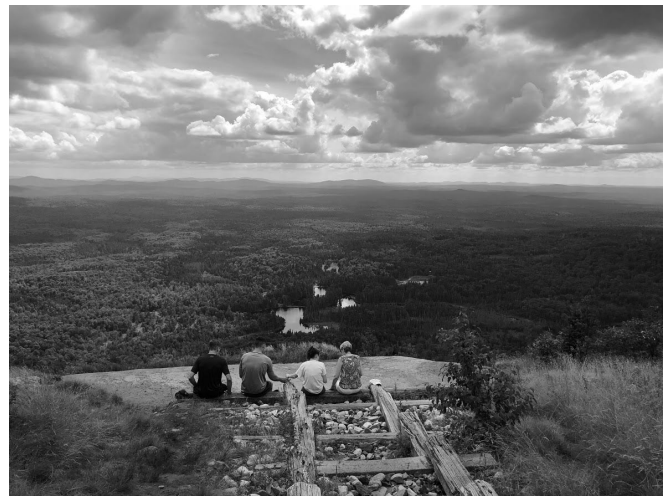
Family Picnic on Azure Mt.