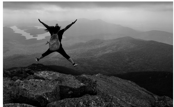
Whiteface Thrill.